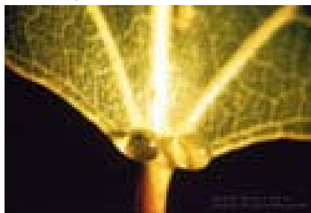
Botanical Society of America

more of the sweet stuff. We feed our bees sugar syrup in different proportions depending on whether we're wanting to ensure their survival during lean times or we're wanting to encourage egg-laying and early build-up. Researchers use sugar syrup freely in all sorts of experiments—for example, in elucidating various aspects of the bee dance. And some of us even feed sugar syrup to hummingbirds, all the while believing that we are mimicking the stuff of flowers. It seems to work. Yet, the nectar of the next flower you see a bee visit may contain any number of additional substances.